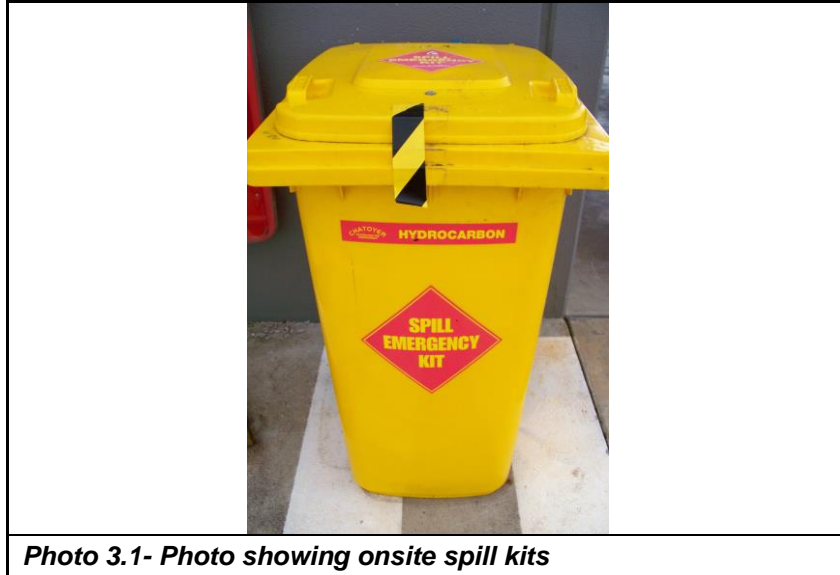
Photo 3.1- Photo showing onsite spill kits